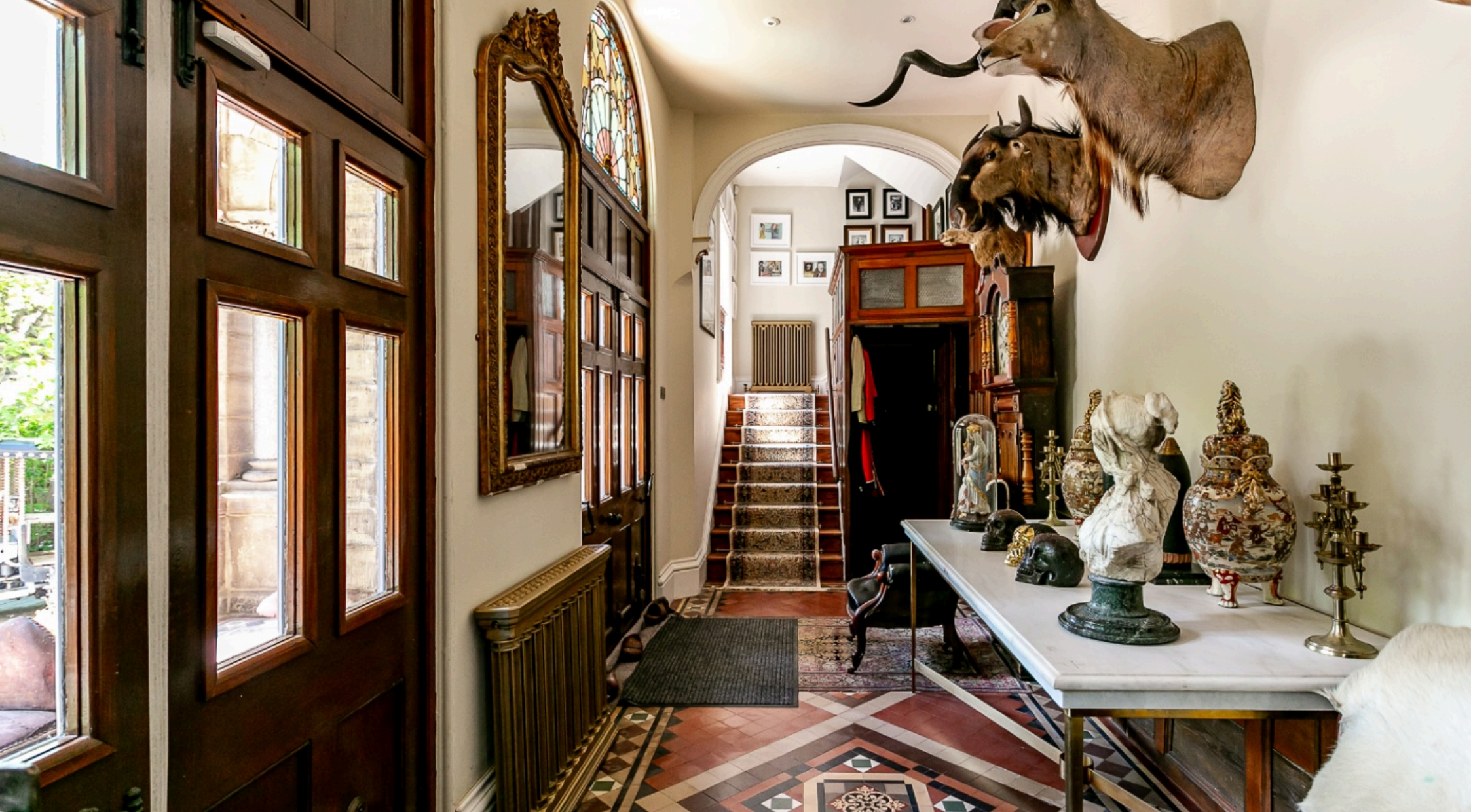
The Chapel, Harrogate, HG1